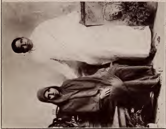
Two child-widows of India. The one at the left has been two months in the Shâradâ Sadan, the other four years.